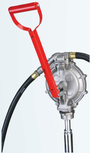
ATD-5025 DOUBLE DIAPHRAGM FUEL TRANSFER PUMP