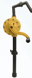
ATD-5019 PLASTIC ROTARY CHEMICAL PUMP