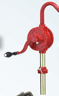
ATD-5009 HAND ROTARY BARREL PUMP