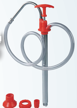
ATD-5024 EZE FLO PUMP