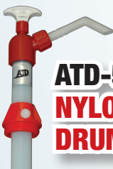
ATD-5027 NYLON VERTICAL DRUM PUMP