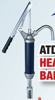
ATD-5007 HEAVY-DUTY BARREL PUMP