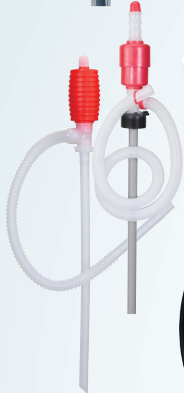
ATD-5017 2-PC. SIPHON PUMP SET