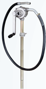
ATD-5020 HEAVY-DUTY BARREL PUMP