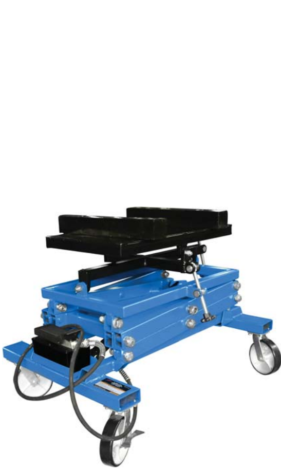
(Shown in down position)