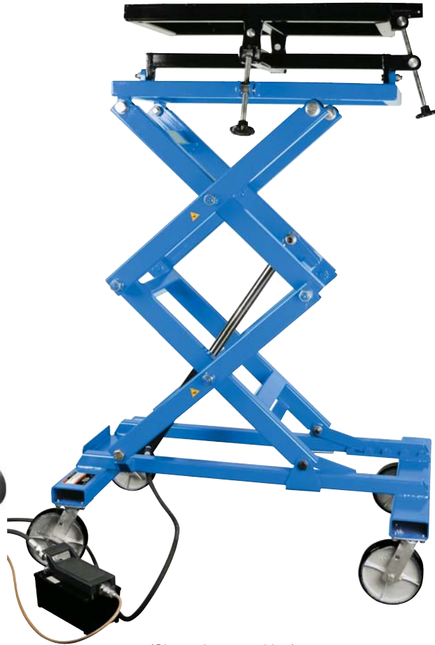
(Shown in up position)