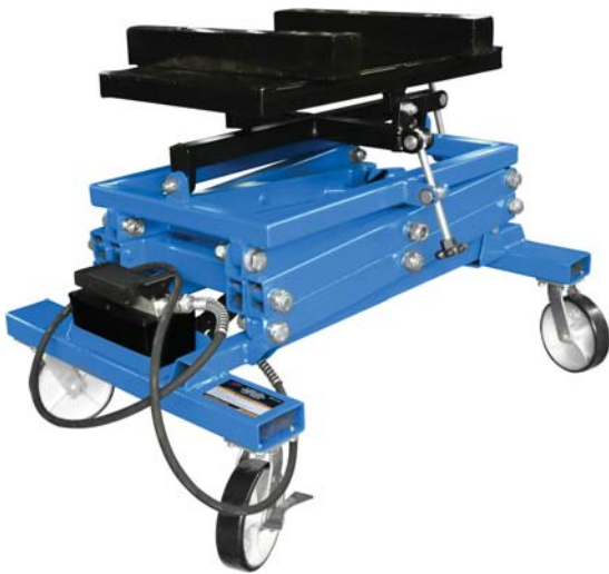
(Shown in down position)