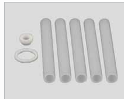
An extra set of spare seals and flow control tubes included with each pump

WARNING WARNING: This product contains chemicals, including lead, known to the State of California to cause cancer, birth defects or other reproductive harm. Wash hands after handling.