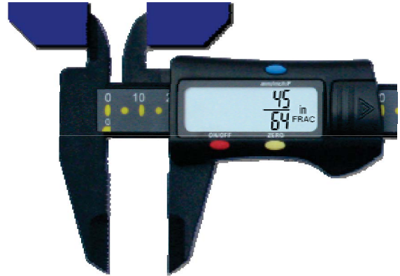
Measurements of internal dimensions