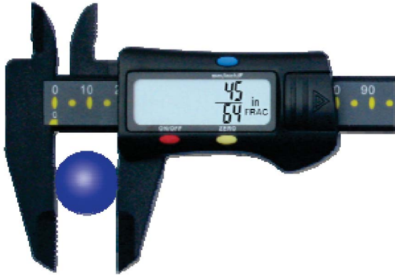
Measurements of external dimensions