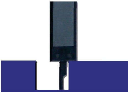
Measurements of depth