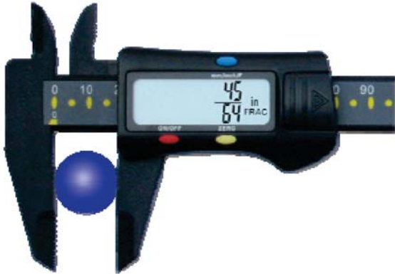
Measurements of external dimensions