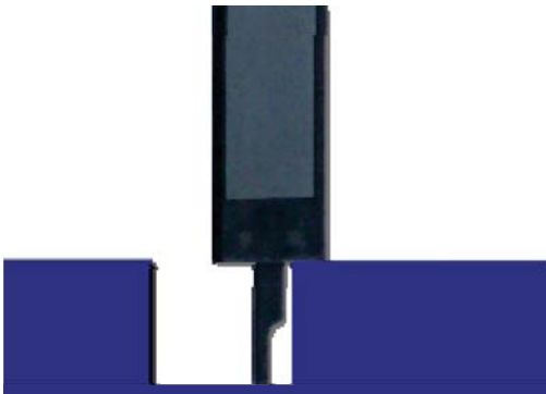
Measurements of depth