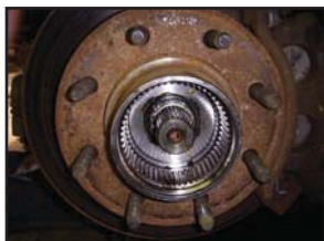
6. Remove snap ring from axle shaft.