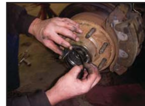
5. Remove spring clip.