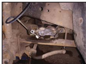
10. Support caliper to protect brake hose using a bungee cord or set on leaf spring.