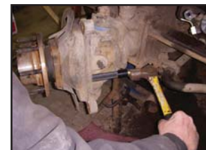
13. Turn steering wheel to the right and tap on the tool. Turn back to the left and tap again. Go back and forth until the bearing is removed.