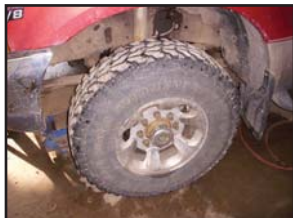
2. Remove lug nuts and wheel.