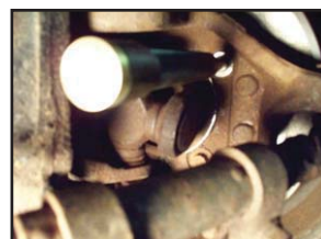
15. When using either the Dodge attachment, or the Hub Tool alone, if the tool will not thread on, turn the axle to reposition the U-joint, then it will thread on.