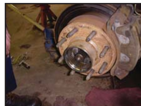
8. The hub is now removed.