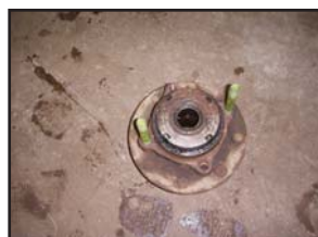
14. Bearing assembly.