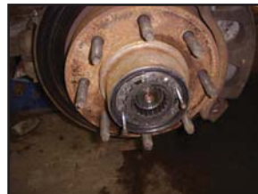
4. Put two screws in as shown. Push in to release tension spring.