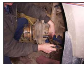
12. Remove the nuts holding the bearing assembly. The nuts are 21 mm thin wall socket.