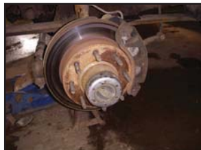
3. Remove manual locking hub (This is a Warner Hub Assembly).