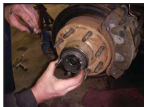
7. Pull the hub out.