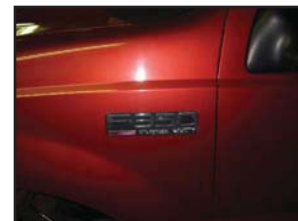
1. 1999 Ford F-350 Pickup Crew Cab Diesel 7.3 LTR