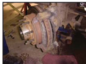
11. Remove the brake rotor.