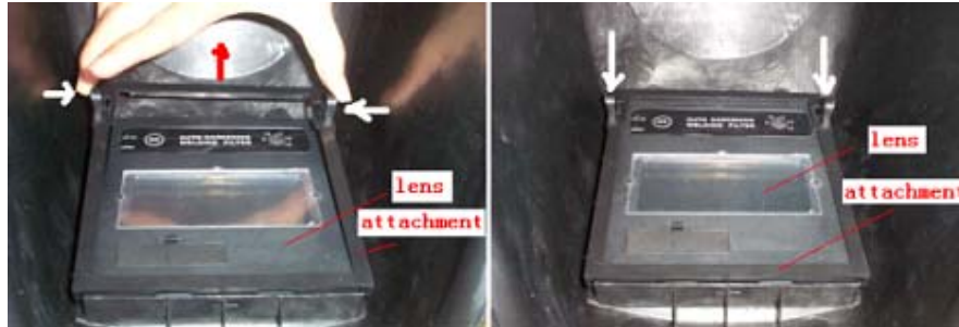
Picture 2. Pull out and install lens

·Step 4: Put the lens back. First put the bottom edge of the attachment and lens together. Then put them down into the cassette square of the helmet, with the two holes of them onto the two knots of the cassette square. At the end, put the ear of the attachment directly down. You can hear a “click”, that is ok.